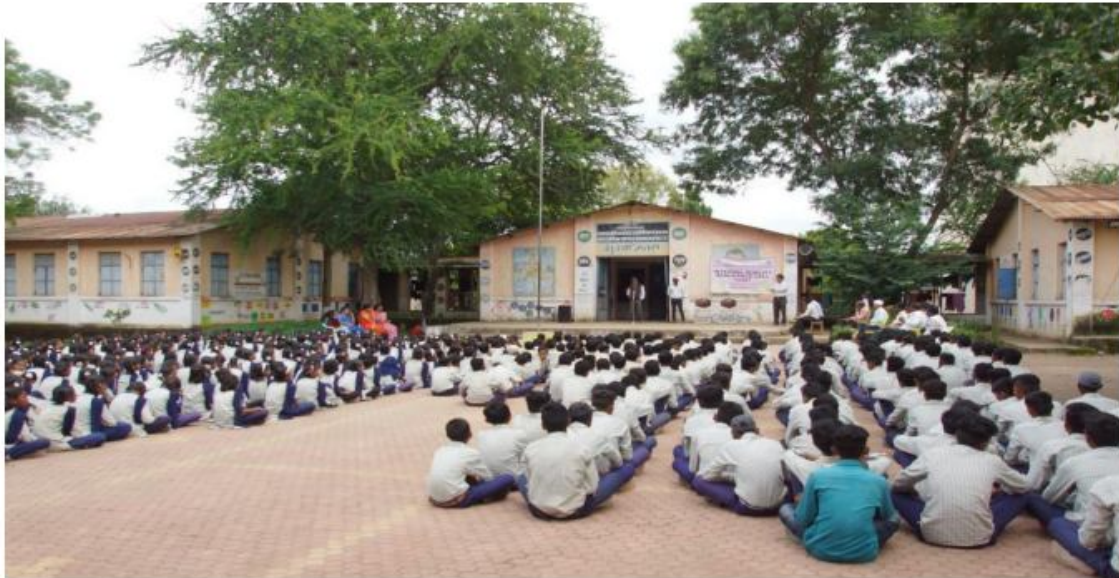
Students attending lecture on elimination of superstitions