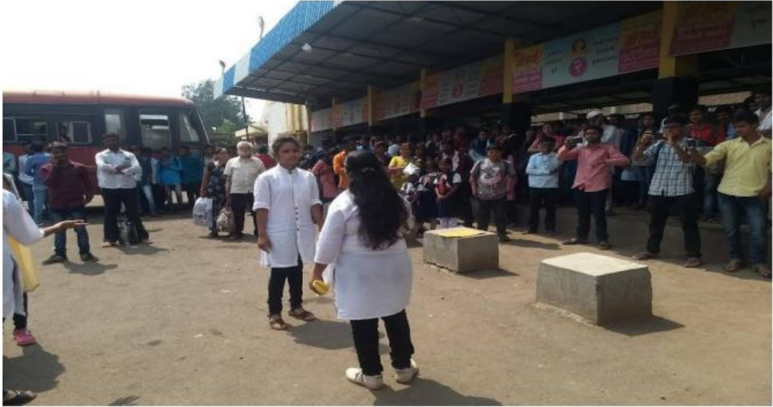
NSS Volunteers performing a Street play on eradicate superstitions at Kalwan bus station