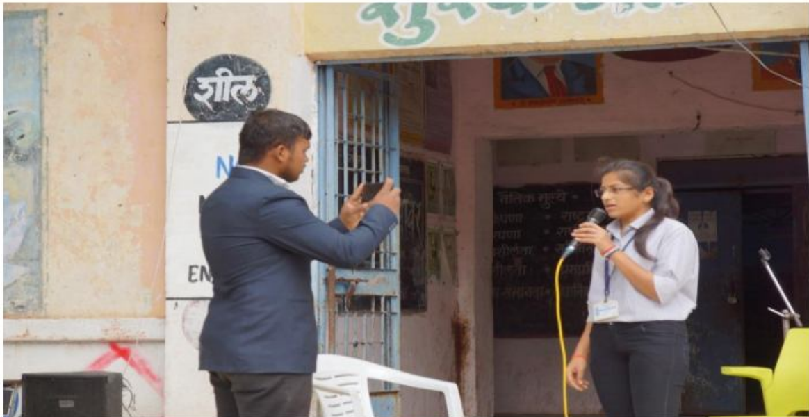
College Students performing a street play to eradicate superstition at government ashram school Narul.