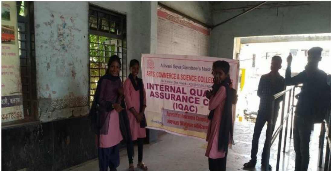
NSS Volunteers performing a Street play on eradicate superstitions at Kalwan bus station