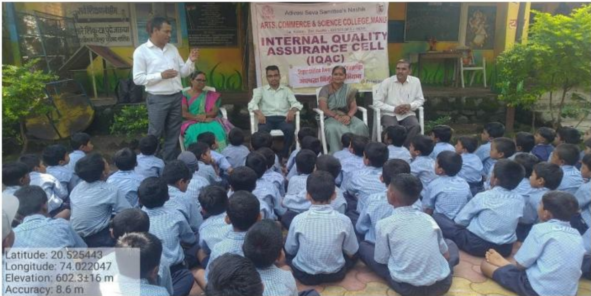
Superstition Eradication Committee Coordinator demonstrate on elimination of superstitions to students at Zilla Parishad Primary School Patvihir.