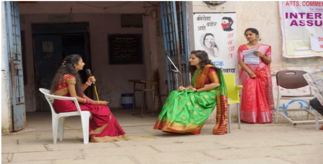
College Students performing a street play to eradicate superstition at government ashram school Narul.