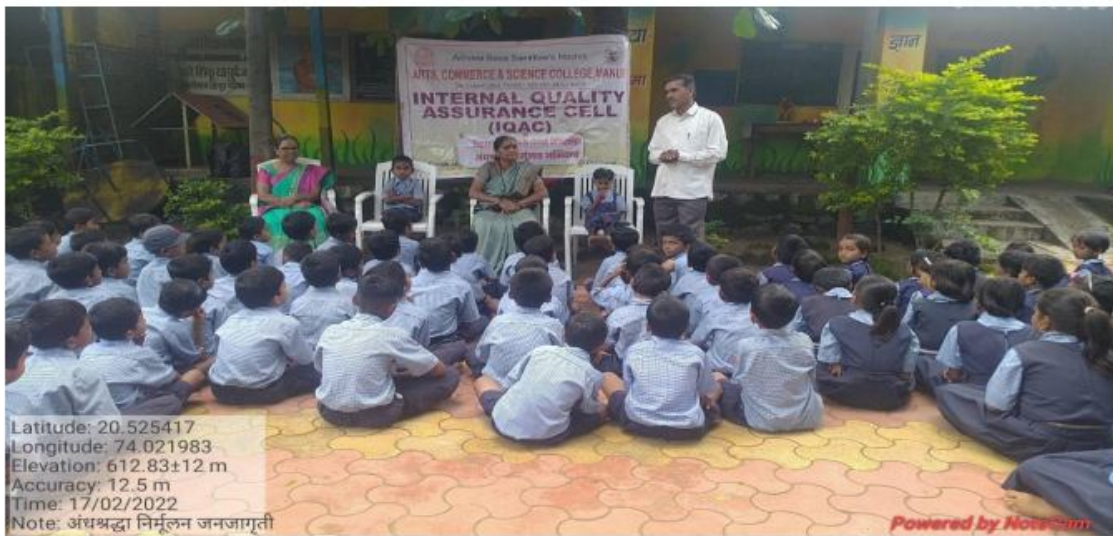
Zilla Parishad Teacher giving a demonstration on elimination of superstitions to students of Zilla Parishad Primary School Patvihir.